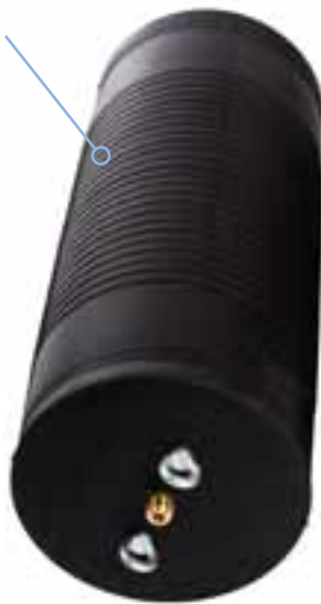
PLUGY HP 6 BAR, 12 BAR DESIGN