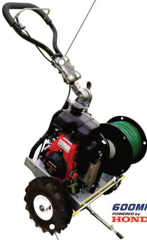
600MH POWERED BY HONDA