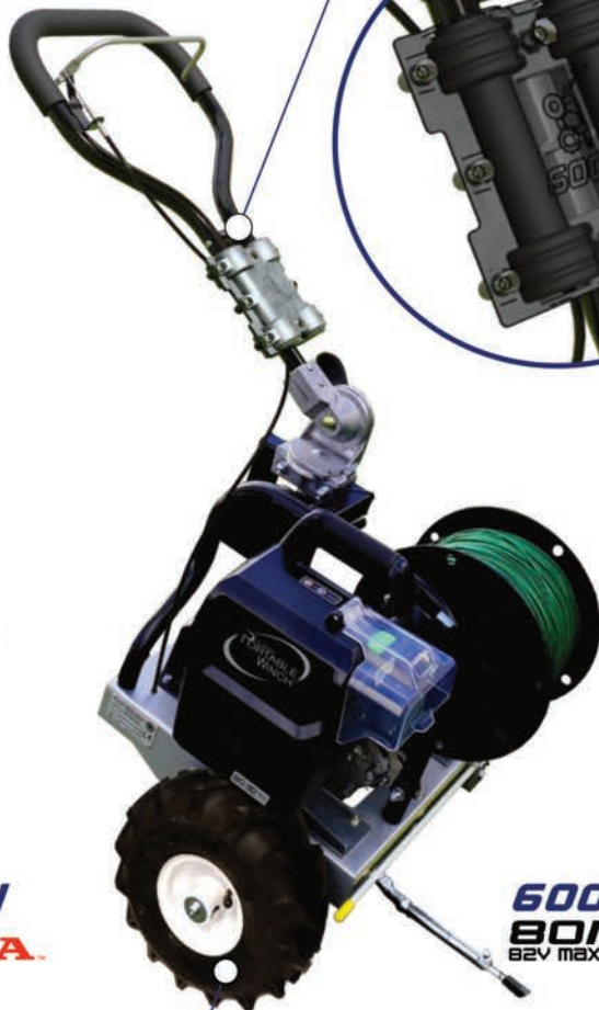
600MH-LI 80V 82 VOLT LITHIUM 82V MAX

AG TIRES - Improved traction in wet and slippery conditions - No dirt build-up in muddy terrain conditions