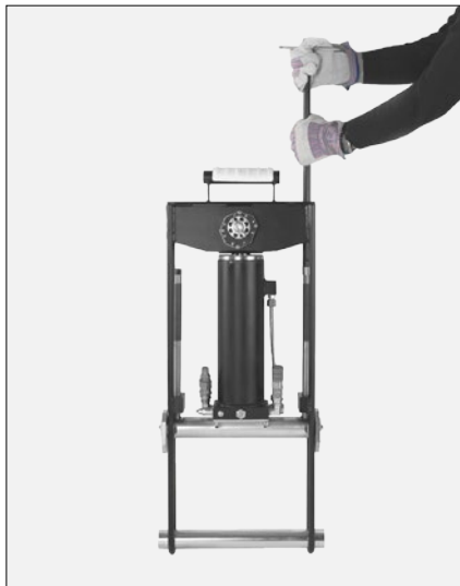
Long "T" wrench for the mechanical safety blocking of the pipe when in total compressio

ST225 is a pipe compressing tool designed for stopping the flow in polyethylene pipes for gas and water with diameters up to 225 mm (9"), it has no typical limitations of similar tools that for the compression use common hydraulic jacks "bottle". ST225 allows a slow reopening of the jaws at the end of the compressing, the tube can be damaged more in the re-opening phase than in the compressing phase because the rapid re-opening, typical of the bottle jacks, causes the so-called "entanglement" phenomenon of the polyethylene fibers, the too rapid reopening does not allow the polymer molecules to return in order in the original position (entanglement) causing rupture breakers in the tube that often result in a break, ST225 avoids this possibility. Thanks to the robustness and its exclusive features ensures the best results and can not be missing in the equipment of modernly equipped teams.