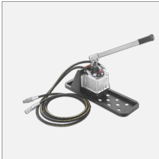
Hydraulic pump and flexible hoses