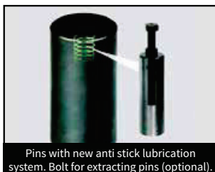
Pins with new anti stick lubrication system. Bolt for extracting pins (optional).