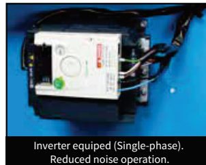
Inverter equipped (Single-phase). Reduced noise operation.