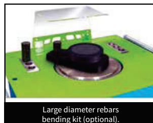
Large diameter rebars bending kit (optional).