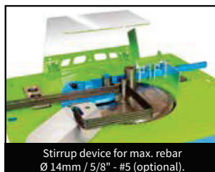
Stirrup device for max. rebar \varnothing 14\text{mm} / 5/8 " - #5 (optional).