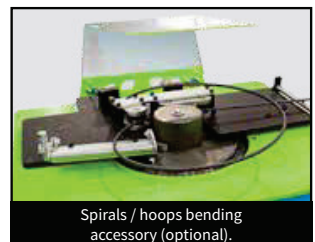
Spirals / hoops bending accessory (optional).