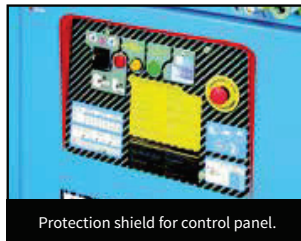
Protection shield for control panel.