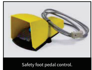
Safety foot pedal control.