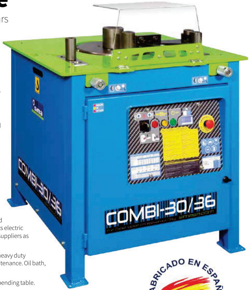
COMBI 30 - 36

One machine, a single investment to do all rebar jobs with a medium production: bending, cutting, stirrups and spirals / hoops.