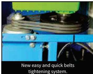
New easy and quick belts tightening system.