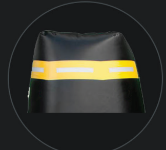
PROTECTIVE CAP 7.0 kg (15 lbs) 587031