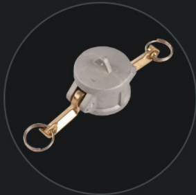
BLIND COUPLING 1 1/2" 0.3 kg (0.7 lbs) 574581