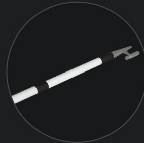
INSERTION POLE 2.0 kg (4.4 lbs) 581228