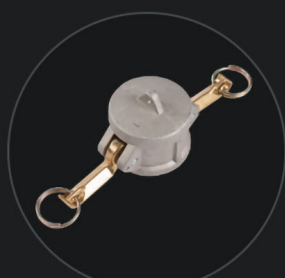
BLIND COUPLING 1 1/2" 0.3 kg (0.7 lbs) 574581