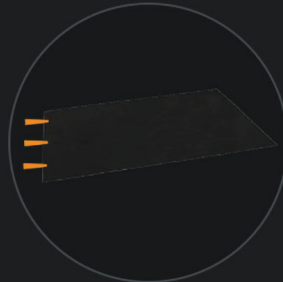
TOP COVER PVC 579669 2.0 kg (4.4 lbs) RUBBER 581226 9.9 kg (22 lbs)