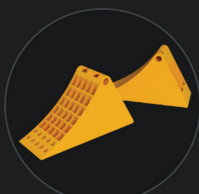
WEDGE 1.5 kg (3.3 lbs) 581229