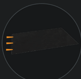
TOP COVER PVC 579669 2.0 kg (4.4 lbs) RUBBER 581226 9.9 kg (22 lbs)