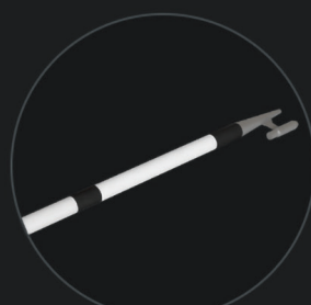
INSERTION POLE 2.0 kg (4.4 lbs) 581228