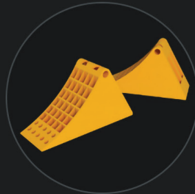
WEDGE 1.5 kg (3.3 lbs) 581229