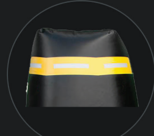
PROTECTIVE CAP 7.0 kg (15 lbs) 587031