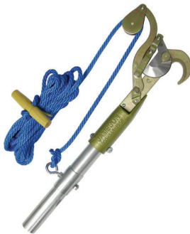
PH-14-PKG A-14 Pruner, Adapter & Rope

Double pulley for additional leverage and significant reduction in required pulling force. 1.25" cutting capacity. Adapter included.