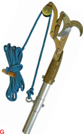
PH-34-PKG JA-34 Pruner, Adapter & Rope