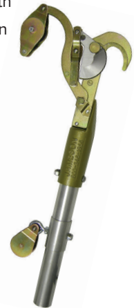
JA-14DP Double Pulley Pruner

Swivel provides versatility in pull direction and more leverage with less pressure on pulley arm. 1.25" cutting capacity