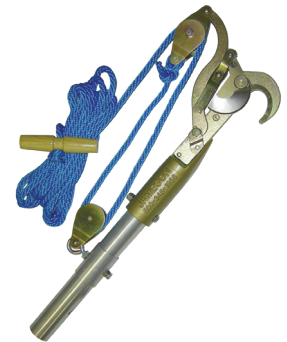
JA-14DP-PKG JA-14DP Pruner, Adapter & Rope