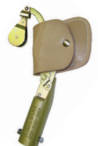
32-18 Pruner Blade Guard

Pruner Rope Insulator attaches to rope to break electrical current if rope contacts energized lines above insulator. Fiberglass tested to 100KV per foot for 5 minutes.