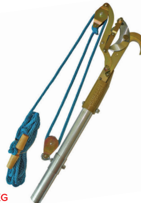
JA-34DP-PKG JA-34DP Pruner, Adapter & Rope