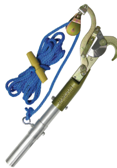
PH-14S-PKG JA-14S Pruner, Adapter & Rope