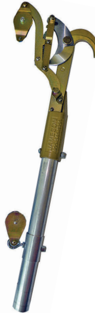
JA-34DP Double Pulley Big Mouth Pruner Big Mouth Pruner with double pulley for additional leverage and significant reduction in required pulling force. 1.75" cutting capacity. Adapter included.