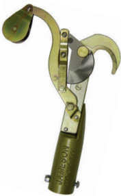
JA-14 Fixed Pulley Pruner