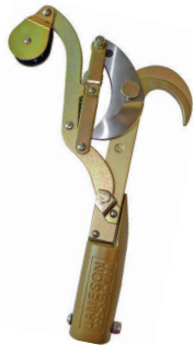
JA-34 Fixed Pulley Big Mouth Pruner 1.75" cutting capacity pruner

Like JA-14 Pruners, the Big Mouth Pruners feature a removable upper spring pin and blade bolt for easy blade replacement and sharpening.