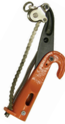
PH-11 Pruner with 1" Center Cut

"Bell B Pruner" Uses SB-1T or SB-2 Saw Blade