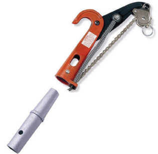
P-11-A PH-11 Pruner with Adapter

"Bell B Pruner" Uses SB-1T or SB-2 Saw Blade