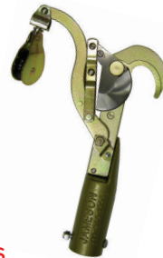
JA-14S Swivel Pulley Pruner

Swivel provides versatility in pull direction and more leverage with less pressure on pulley arm. 1.25" cutting capacity