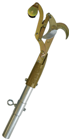
PH-34-A JA-34 Pruner & Adapter