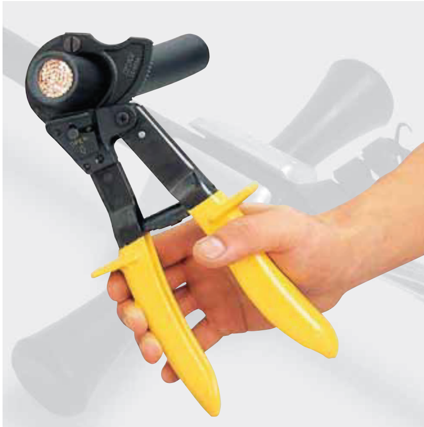
IZ-325A shown with CV 325mm 2 Cu Cable

Maximum cutting diameter : Nonferrous 33mm or 325mm 2 Cu Cable