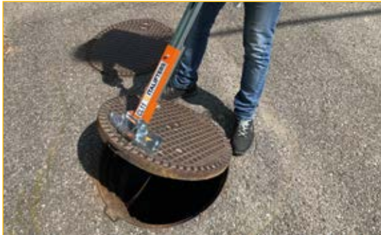
Use 1: manual Opening.

Universal magnetic lifter with curved base to ensure the best magnetic adhesion on the circumference of circular manhole covers also with "filling" cast iron frame and in asphalt / stone / cement with central metal disc.