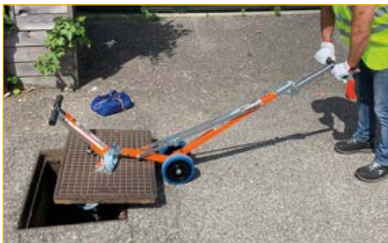
Use 2: opening with wheeled lever APS90 or APS80.