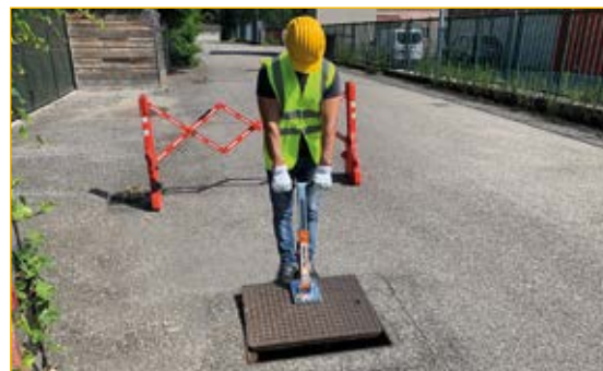
Use 1: manual Opening.