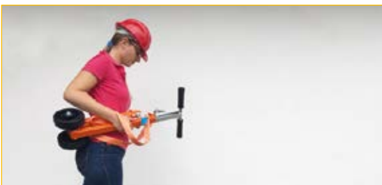
Foldable, extremely compact and light weight, easily transportable.