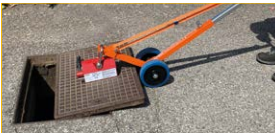
Use 2: combination APS80 and Permanent magnet PM400 or PM500.