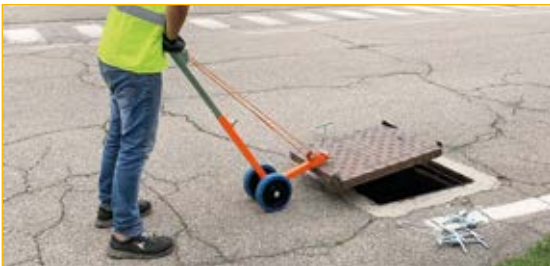
Use 3: combination APS80 with mechanical clamp and hooks set