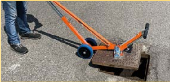
Use 1: opening with magnetic CL9 - CL10 - CL11.

Extendable and tilting upper handle. Lightened and simplified version of the APS90. Ideal for opening manhole covers that have lifting problems, in difficult operations and opening of heavy manhole covers with minimum effort and maximum safety