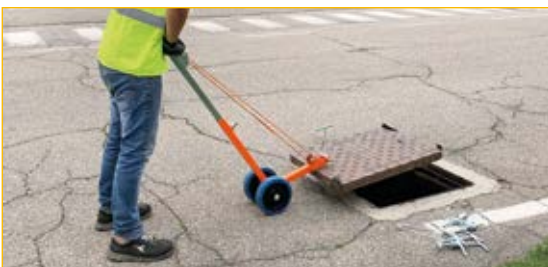
Use 3: combination APS80 with mechanical clamp and hooks set