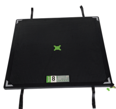
SLK 8 bar

LIGHTER BAGS FOR EASIER MANIPULATION (up to 15%)