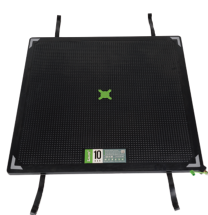
SLK-H 10 bar