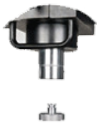
Quick Detachable Top Cover