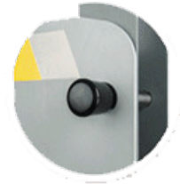
Working Bench Pin with Plastic Sleeve at One End