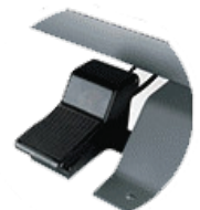
Pneumatic Foot Pedal Switch