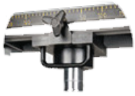
Scale & Sliding Cylinder with Handle and Rotatable Knob