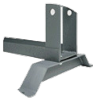
Well-Designed Legs with Bolt Holes