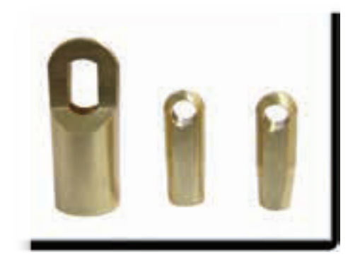
ME-XX, Male End fitting for 5, 7, 9 or 11mm Rod ME – 05/07/09/11, fitting for 5/7/9/11mm rod