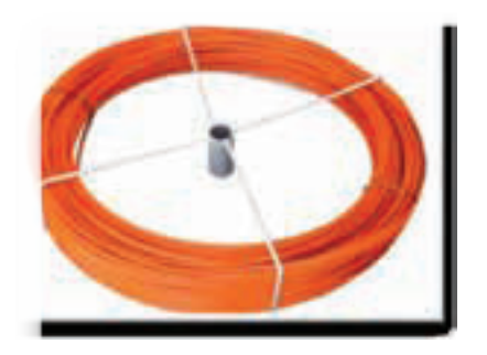
JK-XX, Joiner Kit