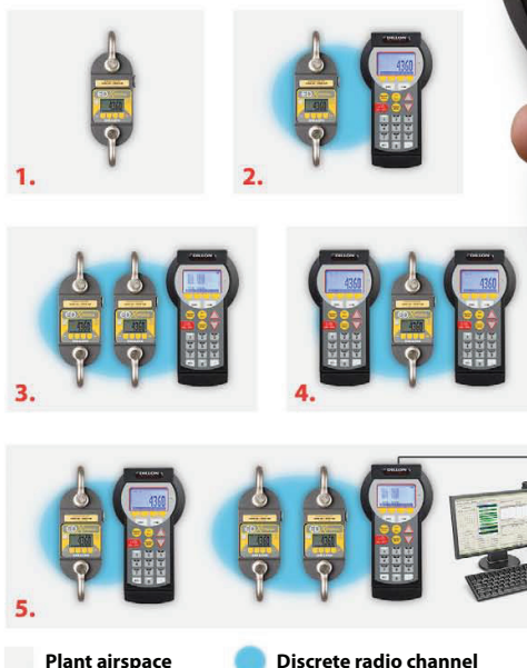
Optional Remote Communicator II