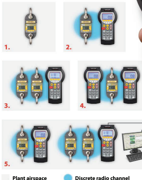
Optional Remote Communicator II