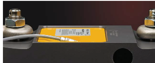
Small details improve durability. The EDXtreme features a recessed connector and embedded antenna to help prevent damage from snags that commonly disable other instruments.

The optional Communicator is an extremely powerful hand-held remote that can define the function and manage the operation of one or more EDXtreme dynamometers using wired or radio technologies. Through the programmable SOFTKEY interface, one or more Communicators can monitor multiple dynamometers within the same airspace. In multiple-link lifting arrays, the Communicator can display readings at any or all lift points and calculate the total load.