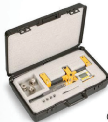
Carrying case available.

Dillon also manufactures highly accurate tensioners, mechanical dynamometers and crane scales.