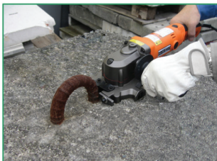
Get rid of unwanted protruding rebars or anchor bolts by cutting them cleanly at surface level.