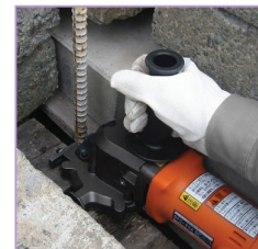
Excellent for narrow places