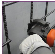
Produce openings quickly.