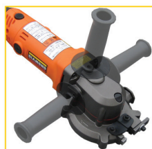
3 way side handle