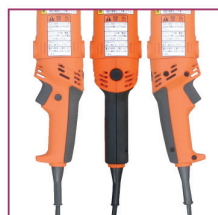
180° rotating grip