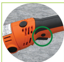
Safety lock switch