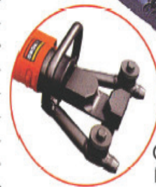
Optional bending hook