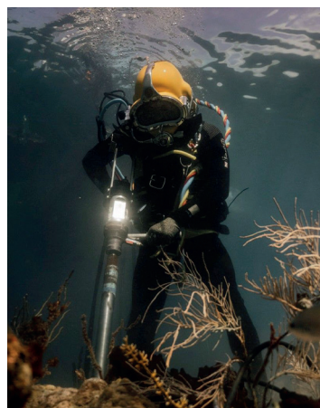
AK46 installed on drill rig